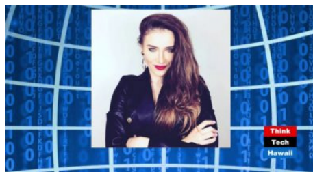
Think Tech Hawaii