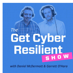
The Get Cyber Resilient Show