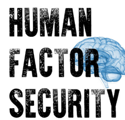
Human Factor Security Podcast