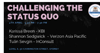
Challenging the Status Quo