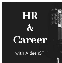
HR & Career with AldeenST