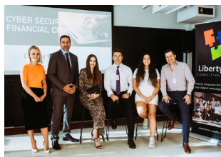
Cyber Security & Financial Crime