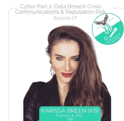
3Ys Owls Podcast