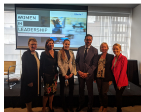
Women in Leadership