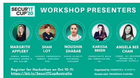
SecurIT Cup Workshop Presenter + Mentor