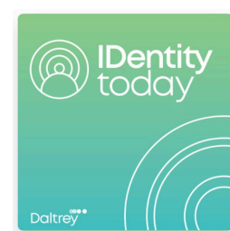
Identity Today Podcast